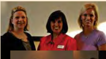
CPR and Basic First Aid Training April 14th at JLI Headquarters