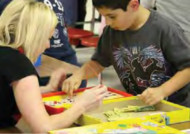
Operation JLI April 21st at 5 community schools