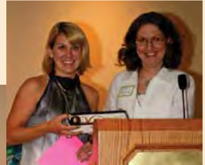
May Meeting May 12th at Gilcrease Museum