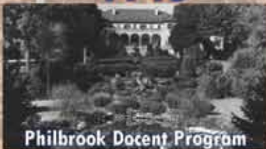
Philbrook Docent Program