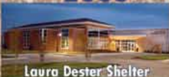
Laura Dester Shelter