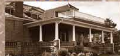
Gilcrease Docent Program